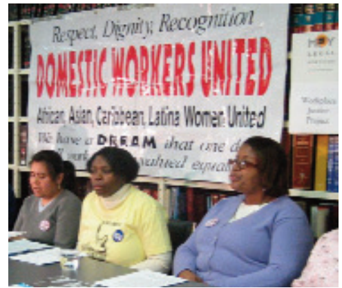
MFY and Domestic Workers United joined forces to bring public attention to rampant wage theft among immigrant workers at a press conference on December 5, 2007.

In 2005, MFY's Consumer Rights Project, developed through a fellowship funded by Patterson Belknap Webb & Tyler, quickly became one of the largest programs in the city offering legal assistance to low-income consumers who are victims of identity theft, improper debt collection practices, and financial scams. Outraged that low-income New Yorkers were finding their bank accounts restrained as a result of default judgments in cases they knew nothing about, the Project exposed rampant "sewer service" in debt collection cases in its white paper, Justice Disserved . This report formed the basis of a major advocacy campaign to end sewer service, culminating in new legislation requiring stricter proof of service, and spurred action by the Attorney General against egregious offenders.