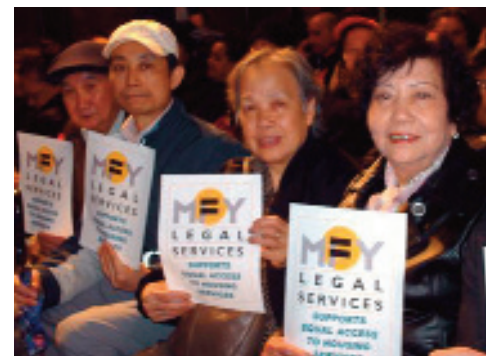
Clients from Chinatown joined MFY to demand better language access services from city agencies at a City Hall hearing in March 2008.