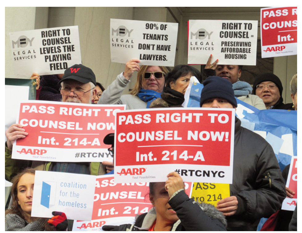
MFY joined tenants and advocates at City Hall to press for a Right to Counsel.

"Bronx landlords sometimes induce tenants to live in their buildings by offering a 'preferential rent'— a rent lower than the legal rent under the Rent Stabilization rules," said Ms. Goodridge. "But many of these tenants do not (continued on page 2)